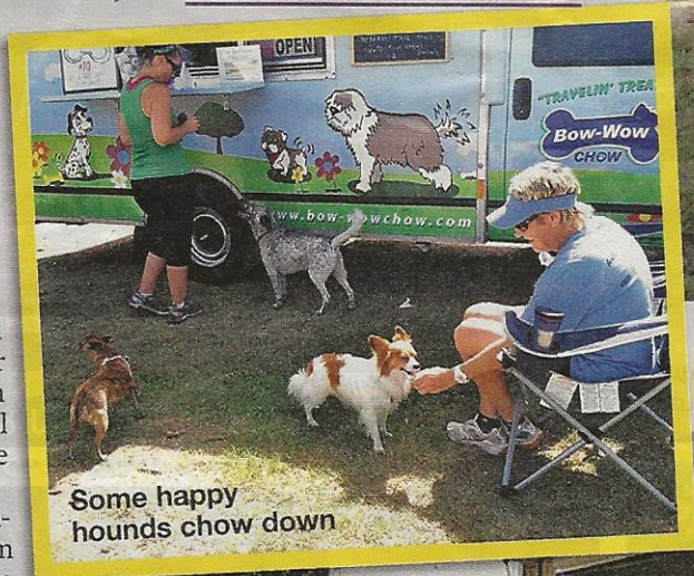
Some happy hounds chow down